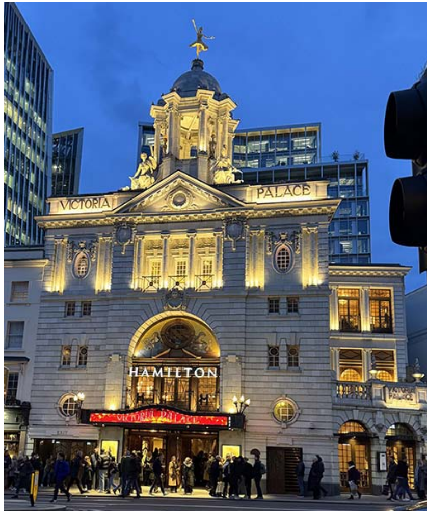
We have been to three shows: Les Miserables, Hamilton and Tina-Tina Turner the Musical. The last two were very good, plus performed in much smaller theaters.