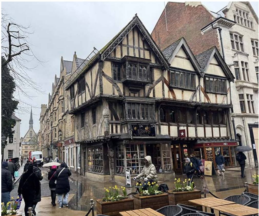
On a rainy, cold day, we did a small group tour of the Cotswolds and Oxford. The Cotswolds are known for their sheep enclosed in hedgerows, rolling hills, scenic vistas and yellow limestone buildings with slate and thatched roofs. Oxford is a town filled with students and unique buildings such as this half-timber shop. Unlike U.S. universities, Oxford University comprises 36 colleges, three societies and four private halls, each operating completely independently of the others, and totaling 26,000 students.